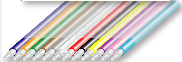
AccuRibbon Fiber Unit